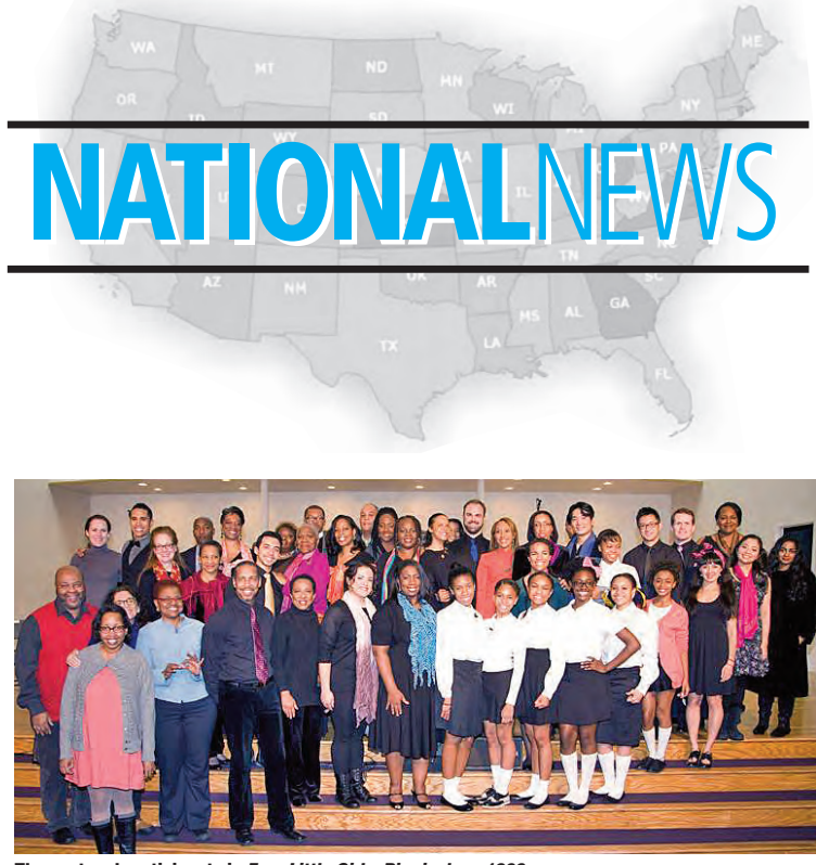
The cast and participants in Four Little Girls: Birmingham 1963.