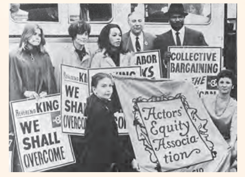
Equity Members join the Memphis Sanitation Department in protesting deplorable conditions for black workers (April, 1968).

eanwhile AEA worked to prove to the industry the viability of what would eventually become known as non-traditional casting. During the late 1950s and early 1960s, it sponsored a series of "integration showcase demonstrations" for producers and casting directors. Equity Library Theatre's many seasons featured racial diversity. In 1986 the union organized a two-day National Symposium on Nontraditional Casting involving more than 500 participants. During the years since, the union's efforts to achieve more diverse ensembles onstage have expanded to reflect its membership of Hispanic and Asian actors as well as artists with disabilities.