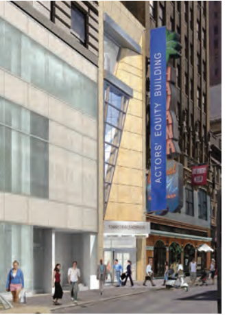
Artist's rendering of the new entrance to the Equity Building in New York.

story structure located at 165 W. 46th Street, Equity sold it in 1981 but retained the land, which yields rental income from the