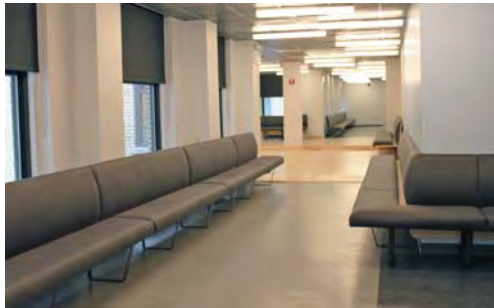
Audition waiting area.

From the outset, the goal was to provide a superior, state-of-the-art facility so that members