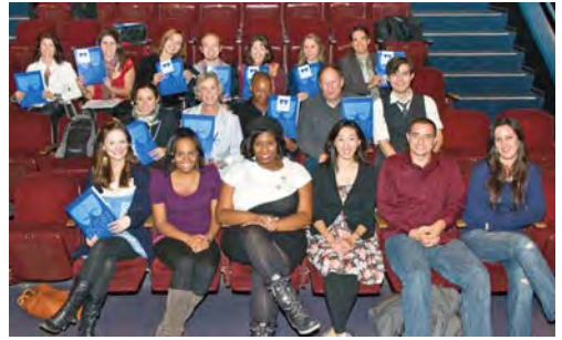
EMCs in San Francisco.