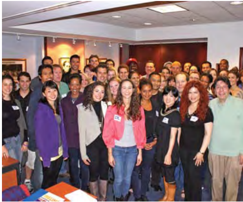
New Member Reception in New York.