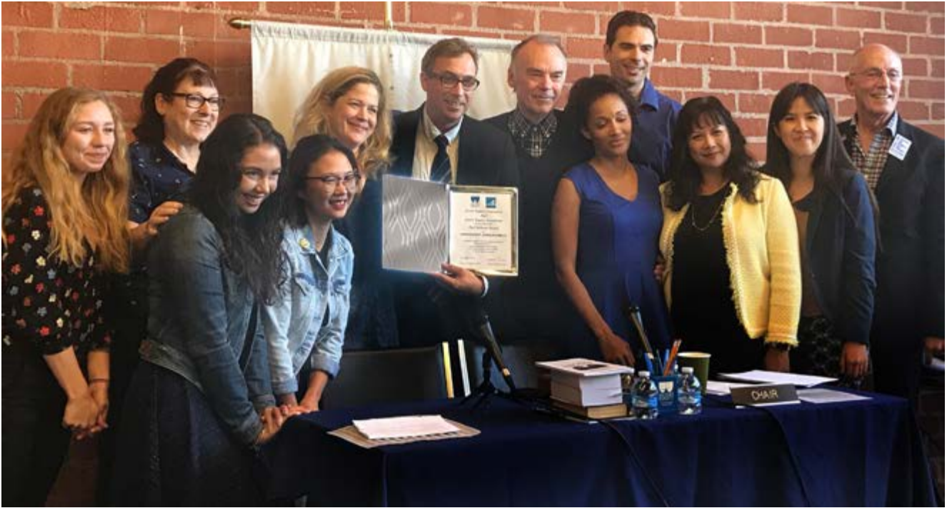
Members of Independent Shakespeare Co. accept the 2018 Robeson Award.